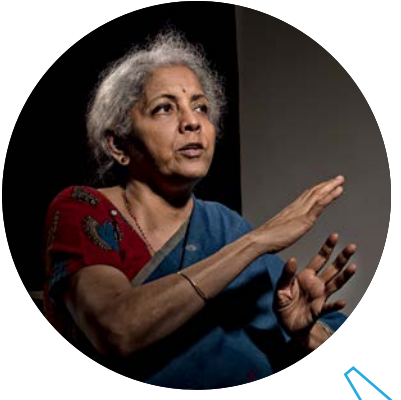
NIRMALA SITHARAMAN, Finance Minister